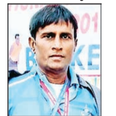
By Our Staff Reporter